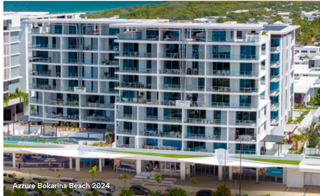
Azzure Bokarina Beach 2024