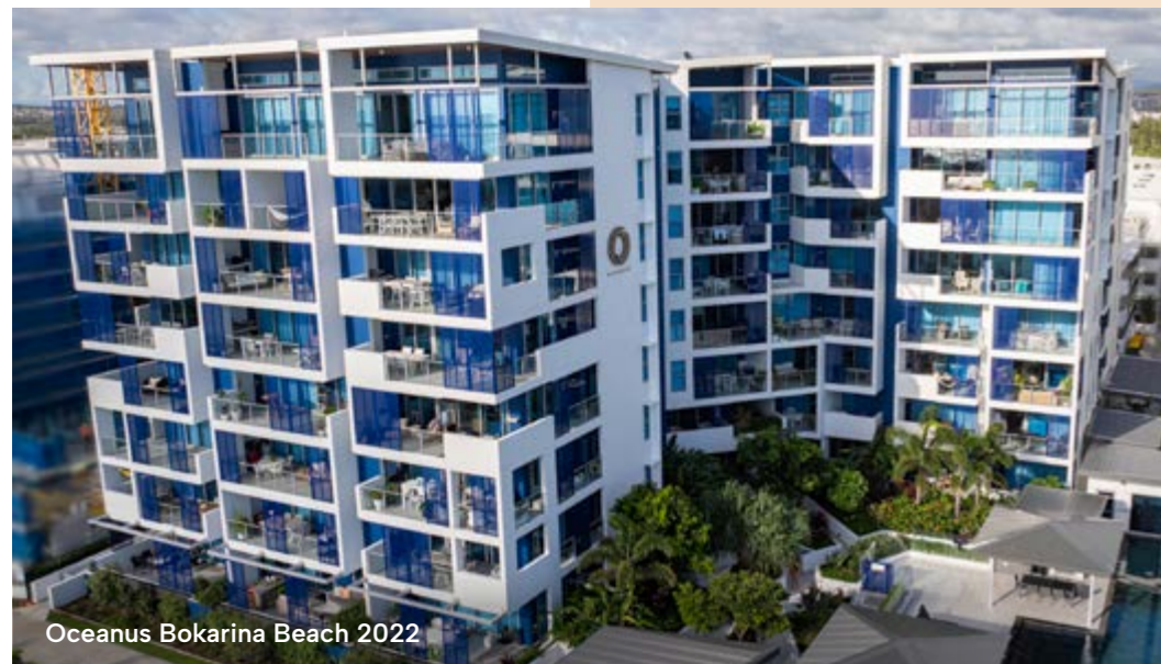
Oceanus Bokarina Beach 2022